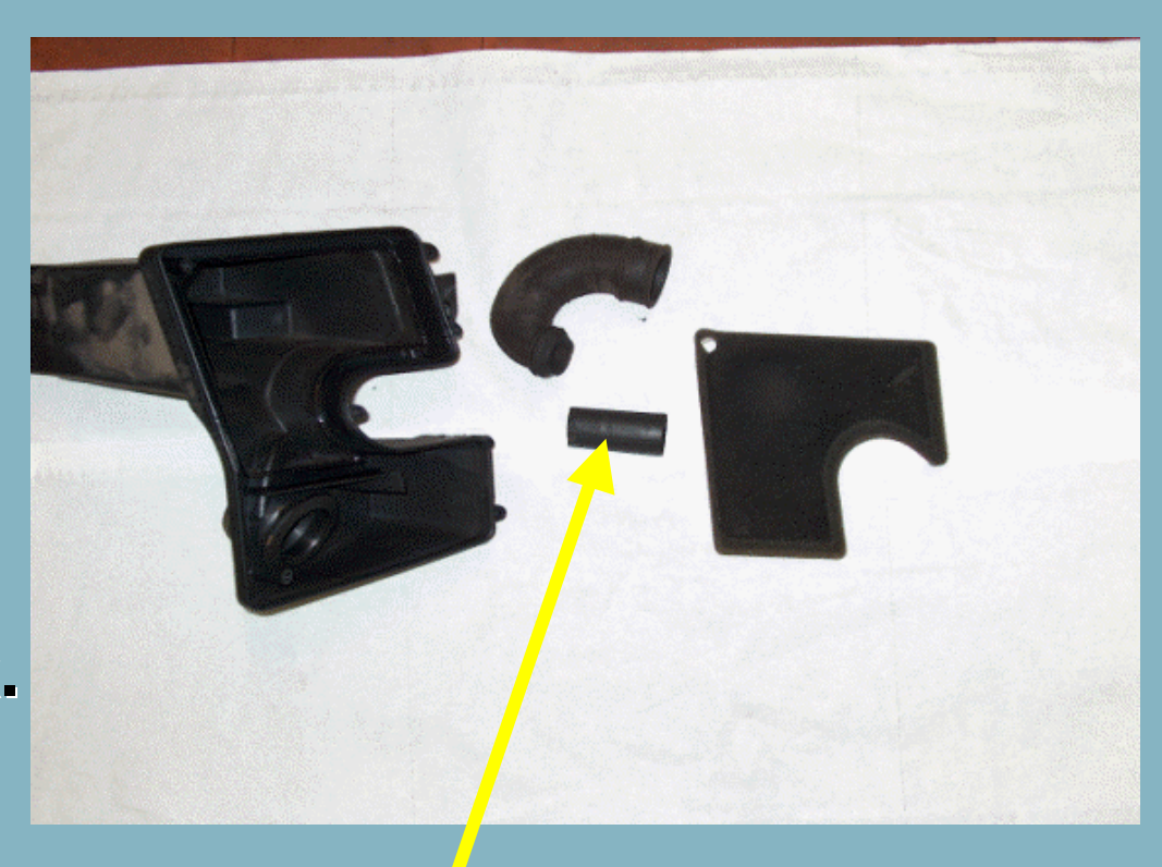
Part to be removed

→ To allow engine to benefit from the whole filtering cartridge surface, we recommend to remove the intake pipe section located inside the filter box.